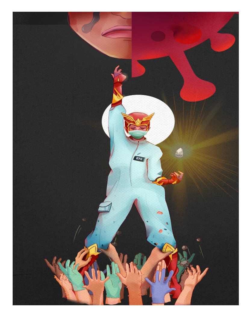
Fig. 3 Padayon: Beyond the Call of Duty amidst adversity

Vol. 9, Issue 3, pp: (148-159), Month: September - December 2022, Available at: www.noveltyjournals.com